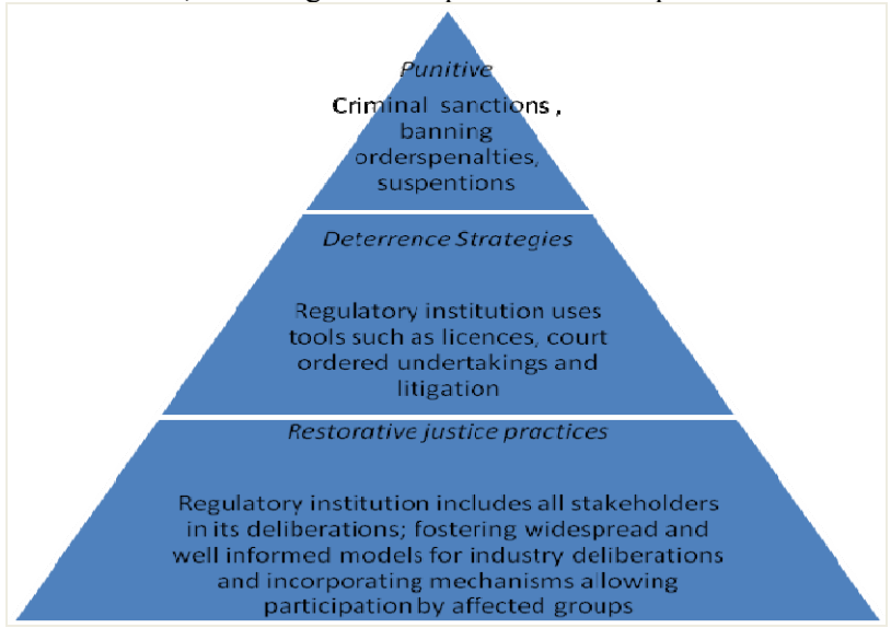
Figure 2: Strategies available to the regulatory institution

The responsive regulation model has been further developed by linking it to restorative justice. Here Braithwaite has sought to examine the changing regulatory landscape and integrate three theories of a justice system – restorative justice, deterrence, and incapacitation. It is recognised that all of these three theories are flawed and the weakness of one is addressed by the strength of the others. However, restorative justice is seen as the goal where the greatest emphasis should be placed; this is reflected by its position at the base of the pyramid with the largest space devoted to it (Figure 2). Stepping up the pyramid are deterrence strategies, which include litigation and revocation of licences. These may be used by the regulatory institution where restorative practices are not effective. At the top of the pyramid are punitive sanctions, including criminal penalties and imprisonment.