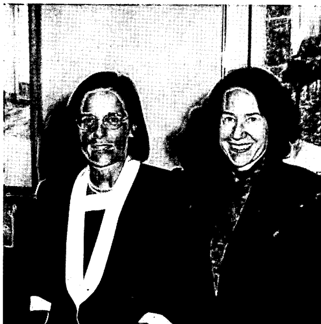
Judge Truss and Justice Beazley