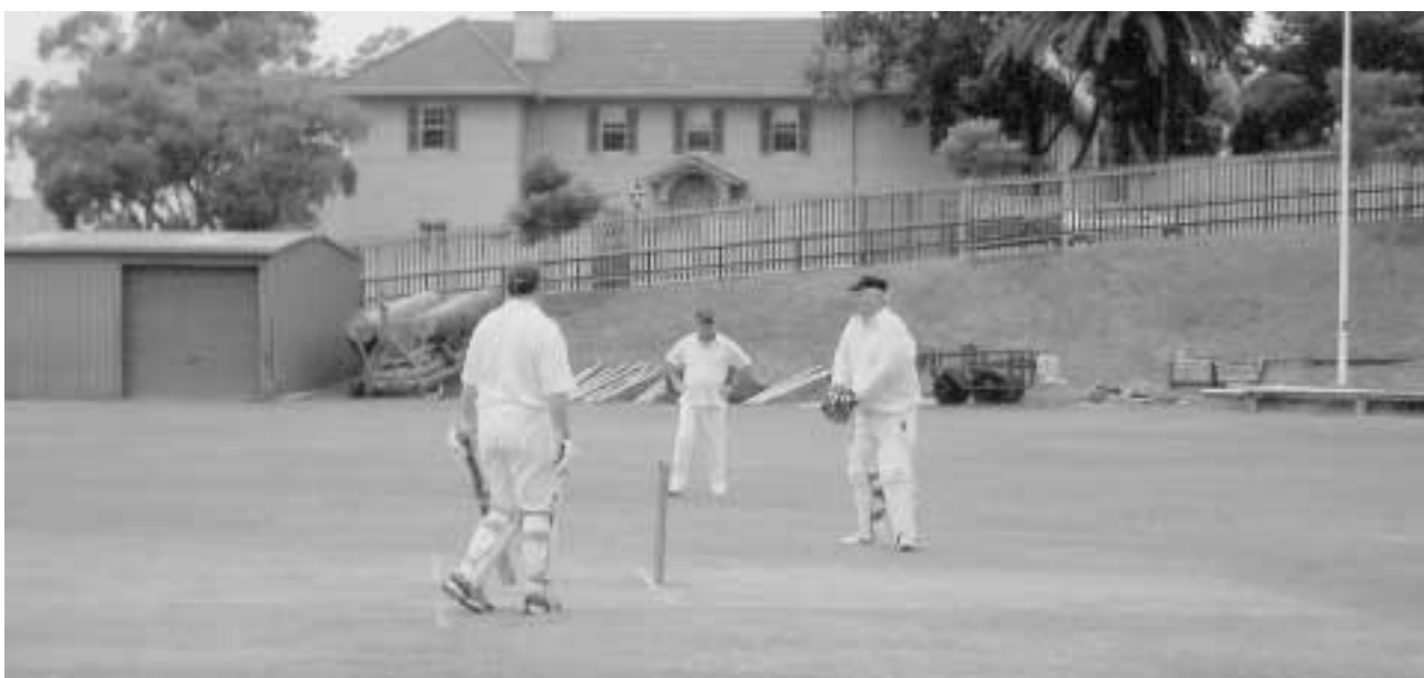
With the gloves...Ireland QC behind the stumps.