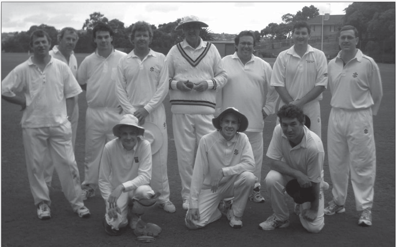
The QLD team.