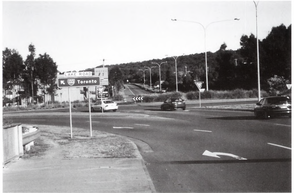
The condition and maintenance of sites such as this link road in Wallsend, NSW (above) and this pedestrian facility in Lambton, NSW (below) may come under increased scrutiny in the near future.

The Woolf Reforms did lead to an initial reduction in the number of claims being received by highway authorities (in the author’s experience possibly by as much as 60% in some areas of the UK), but this initial fluctuation can be