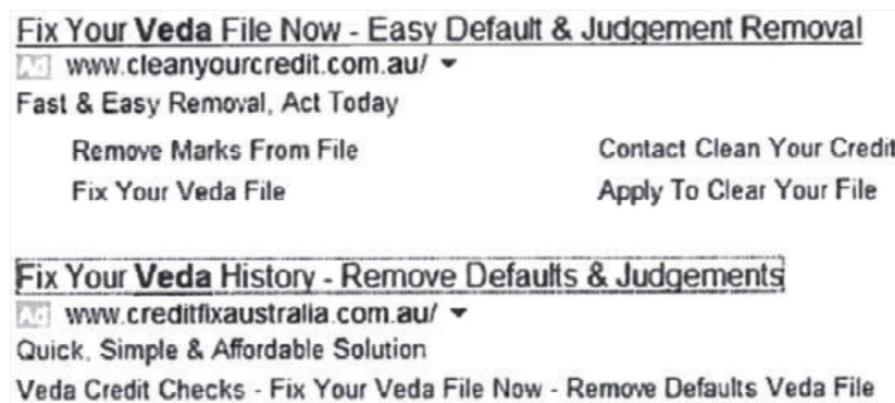
Figure 21.2 Veda Google advertisement

A similarly fact-specific approach to keyword advertising and trade mark use has been adopted in Australia. In Veda Advantage Ltd v Malouf Group Enterprises Pty Ltd , 44 a Federal Court decision from 2016, the plaintiff was a data analytics company that provided credit reports to lending institutions, and was the registered owner of VEDA for financial services. It brought infringement proceedings against a party that had purchased Google AdWords containing the term 'veda', which were used to generate advertisements for its credit repair services, some of which also used the term 'veda'. An example of the defendant's advertising is set out in Figure 21.2.