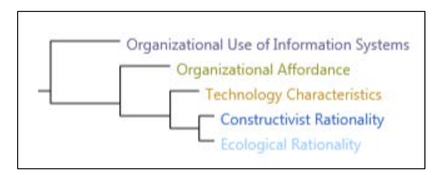
Figure 2. Cluster analysis based on coding similarity

We undertook cluster analysis of the 23 submission documents based on coding similarity to give us some indication of the proximity between categories. The result of the cluster analysis shows close proximity between constructivist and ecological rationalities (see Figure 2). We contend that this proximity implies that these two rationalities form the basis of analysing IS adoption decisions. Along with technological characteristics, these two rationalities are subordinate to the branch of organizational affordance. This finding is logically consistent with prior literature whereby collective rationalities among individuals within organizations facilitate rationalities to act on affordances with the technologies (Zammuto et al. 2007; Leonardi, 2011; Volkoff & Strong, 2013). To deepen our cluster analysis, we examine relevant coded sentences or paragraphs from the 23 submission documents associated with constructivist and ecological rationalities, technological characteristics, organizational affordance, and organizational use of information systems.