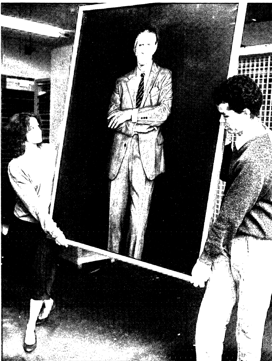
National Gallery staff members produce the portrait of former Prime Minister Malcolm Fraser, following a Freedom of Information request by The Canberra Times .