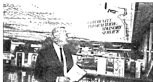
Above: Information at the Parks Community Library (one of the many examples of joint-use libraries in SA).

Peter's visit to SA had varied aspects as the photos show.