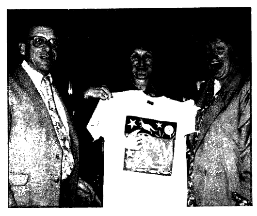
How's this one for size? Shopping at the LAA stand was brisk.