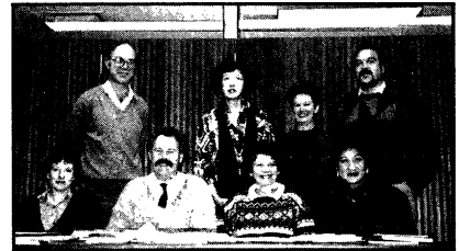
The Victorian Chapter of the Planning Committee for the 3rd National Reference Librarians' Conference, 17-19 Nov., 1989.

Registration forms will be available in August; and the Planning Committee looks forward to seeing you in November.