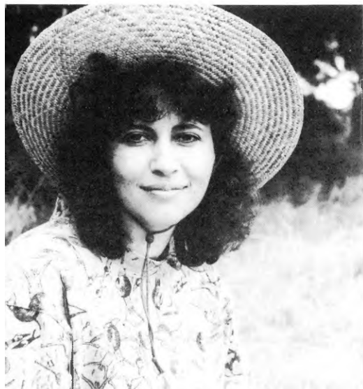
Aboriginal author Sally Morgan, whose papers are held by the NLA.

The National Library of Australia began this process of evaluation with its preparation for the conference Towards Federation 2001: Linking Australians and their Heritage , held at Canberra in March 1992.