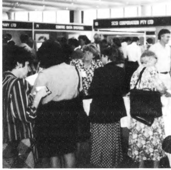
On Disc 95 bodes well for the organising committee of Online & On Disc 96. Watch inCite for dates and program details