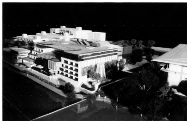
Riverview of State Library

Remaining services will be provided from the National Archives building at Cannon Hill, and the Griffith