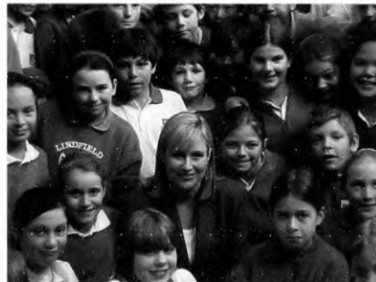
Melissa Doyle, host of Sunrise, reading to students at Lindfield Public School

Our thanks also go to Australia Post who generously supported National Simultaneous Storytime in 2004. We look forward to their continued support of the event.