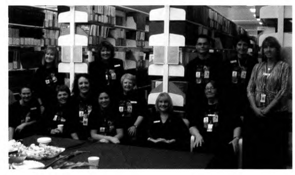
Gardiner Library Service staff sporting commemorative 'Tomb or Treasure' T-shirts

Principal sponsor of LIW 2005, NetAlert Ltd, joined with ALIA in supporting and educating the community about the safe use of the internet, with the launch of the National Libraries Project. The National Libraries Project will provide a range of materials to assist librarians and library users in using the internet safely at public libraries. Participating libraries will receive a copy of the Librarian's guide to internet safety, an internet safety tip card and computer 'wobbler' for display on internet terminals.