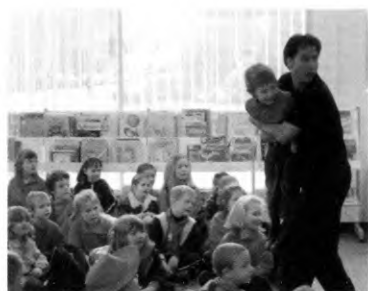
The children of Summerdale Primary School sit and wait to see if Dingo will put wombat in the stew...