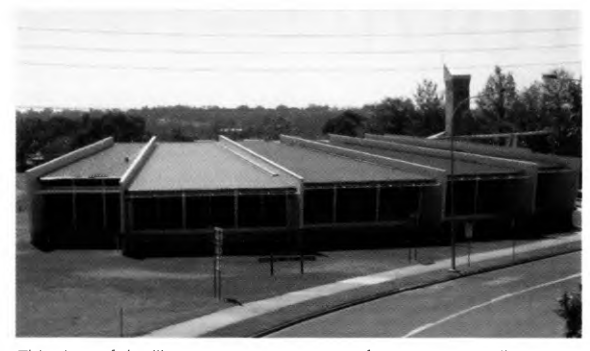
This view of the library attracts comments from many travellers on the New England Highway. West-facing windows are double-glazed.

Planning contained the detail and path to the vision. It was dynamic, constantly revised and updated, with each version better than the last. It was re-