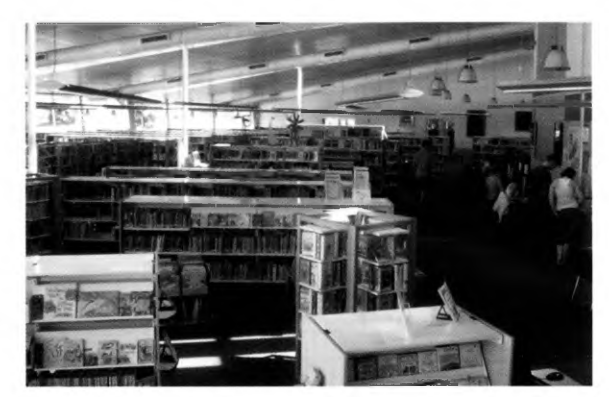
Large windows allow natural light to flow throughout the library

brary in the eyes of both Council and the community. Our success in this laid the path to the new library. In 1986 Singleton library had 3 staff, a stock of 29 845 items, an Apple IIe computer and 93 180 loans per annum. By 1999 it had 9.14 full-time equivalent staff, a stock of 47 015, a network of 23 PCs and server, 5 printers, a scanner and an Internet Service Providers Point