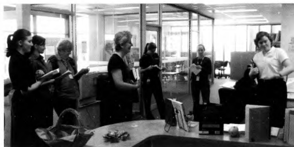
The anatomy island

We ran four tours on the Friday; in the week leading up to the tours invitations were sent out via the hospital's e-mail system, posters and flyers were put up around the hospital. Invitations were sent to the neighbouring university for the medical students and library staff who frequent the Health Library.