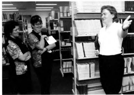
"Please step this way..."

"It's probably best if we move on. If you'll just follow me..." *