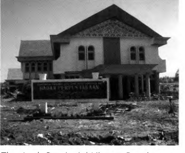
The Aceh Provincial Library, Banda Aceh, late February 2005

desperately needed as most libraries in East Timor have no income and