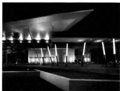
Main entrance to the Convention Centre

Welcome reception : Tuesday 19 September, 5:30–7:30pm. Includes finger food, beverages