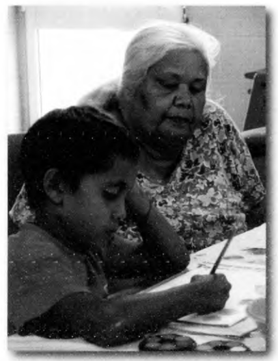
Children's Picture Diaries at Hope Vale in Cape York; local elders and recognised artists volunteered their support.

IKCs are owned, managed, and staffed by the Indigenous Shire Councils, with one council choosing to give up their chambers to accommodate their IKC due to limited infrastructure. State Library facilitates the initial fit out, collection of books, professional development of IKC staff, literacy, and other programs. Often the only public access to computers and internet, IKCs combine library services with a community space for learning, capacity building, and strengthening cultural identity.