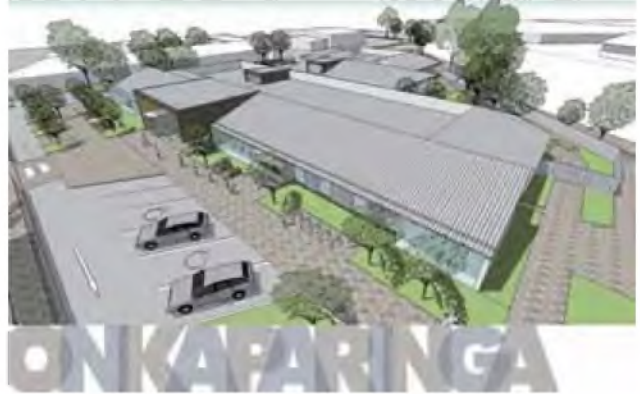
Artists impression of Woodcroft library

Woodcroft library is one of six public libraries in the City of Onkaparinga in South Australia. Since 1991 the original building housing the library has also been home to a neighbourhood centre, housing, health, and allied health services making it a busy community hub for residents in this city. The building design has struggled to meet the needs of all the users as an integrated service and has proved to be an expensive building to run. After many years of planning the building was temporarily closed for redevelopment in April this year. The new building will provide the community with a fresh modern facility which will also showcase the latest in green technologies.