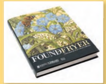
Found in Fryer: a taste of the treasures of the Fryer collection