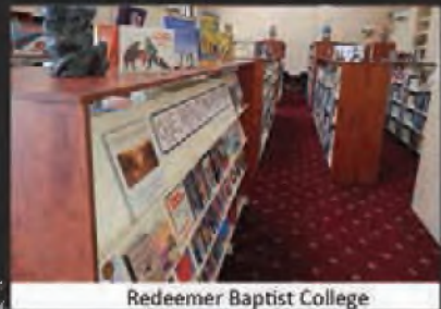
Redeemer Baptist College

50 years of Kingfisher™ library systems in Australia proves the test of time: wherever how Kingfisher™ can create your library.