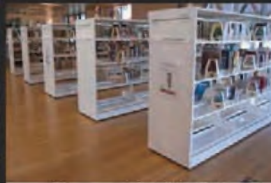
Ravenswood School for Girls