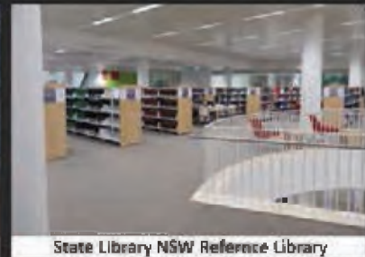
State Library NSW Reference Library