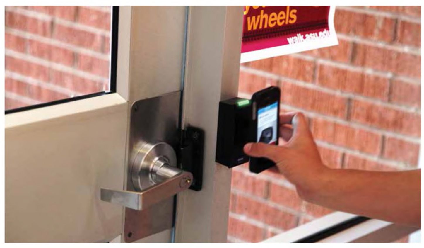
Smart cards can provide access to much more than a physical space

There are many different layers of access available through the humble smart card these days, many of which can benefit the library and information sector. While the traditional proximity (or prox) card is an effective and trusted method of allowing access to certain