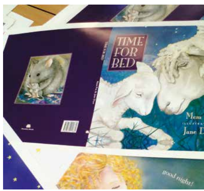
Time for Bed proofs

As I worked through the collection, I became more familiar with the key players at Omnibus Books. Documents and items revealed the specialised roles undertaken by individuals. From notations on manuscripts to signatures on forms, a picture of this unique publishing team emerged.