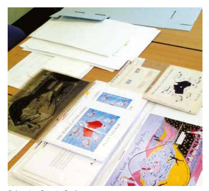
Rehousing Captain Cook