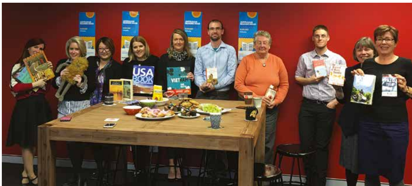
ALIA House staff with their Australian Reading Hour books!