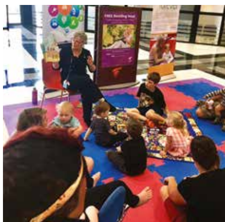
Australian Reading Hour in Gympie