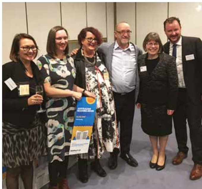
From the launch of Australian Reading Hour 2017