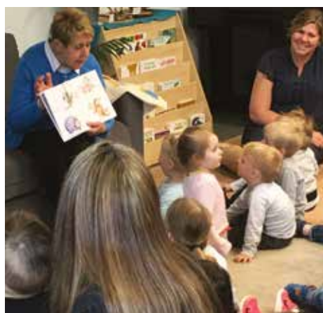
Mem Fox reading at the launch of Australian Reading Hour 2017