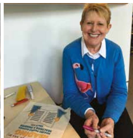
Mem Fox signing an Australian Reading Hour tote bag