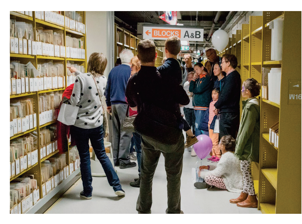
Visitors at the National Library of Australia Open Day in August 2018.

Fast forward to 2018, and for every person who comes into our building, there are 60 people using our digital collections and services. So as well as knowing that our building is filled to the brim with our magnificent physical collections that are used daily, we also know that Australia's digital heritage is streaming out from our server room, 24 hours a day, 365 days a year. We used digital channels to reach Australians throughout this anniversary year – not so much to commemorate 50 years in the building, but to communicate what we offer in 2018, how, and to whom. We know those digital collections are reaching Australians in every city, town, and outback property, giving us the opportunity to serve Australians who may never be able to visit in us in person. Australia, after all, has a small population scattered across a very, very large continent.