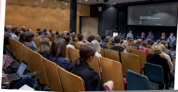
Australasia Preserves at the State Library of NSW, 26 July 2018.

Feedback has been an important driver, with participants indicating from the beginning that practical hands-on training is highly desired. This was first explored through the development of a Digital Preservation Carpentry lesson, delivered in the Carpentries style as a workshop at the International Digital Curation Conference 2019. Feedback from attendees and the workshop team indicated areas in which the workshop content and format could be improved. This has led to the formation of a working group and development of the concept of Digital Preservation