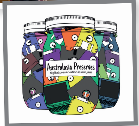
Australasia Preserves illustration by Matthew Burgess

Essentials, a series of workshops and lessons covering various functions and aspects of digital preservation work. This content will be aimed at those who want to move from theoretical knowledge of digital preservation to practical skills, and who want to understand the reasoning behind tools and technology choices for handling digital materials. In all lessons, digital preservation concepts will be tightly coupled with experimentation with open source tools. This is aimed at clearly detailing the principles behind what digital preservation requires to inform the tool choices needed to perform various tasks.