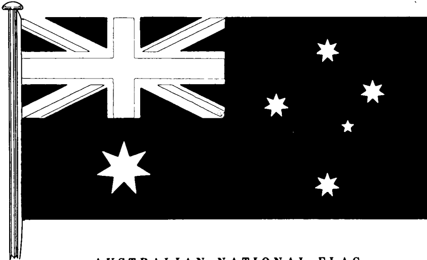
AUSTRALIAN NATIONAL FLAG